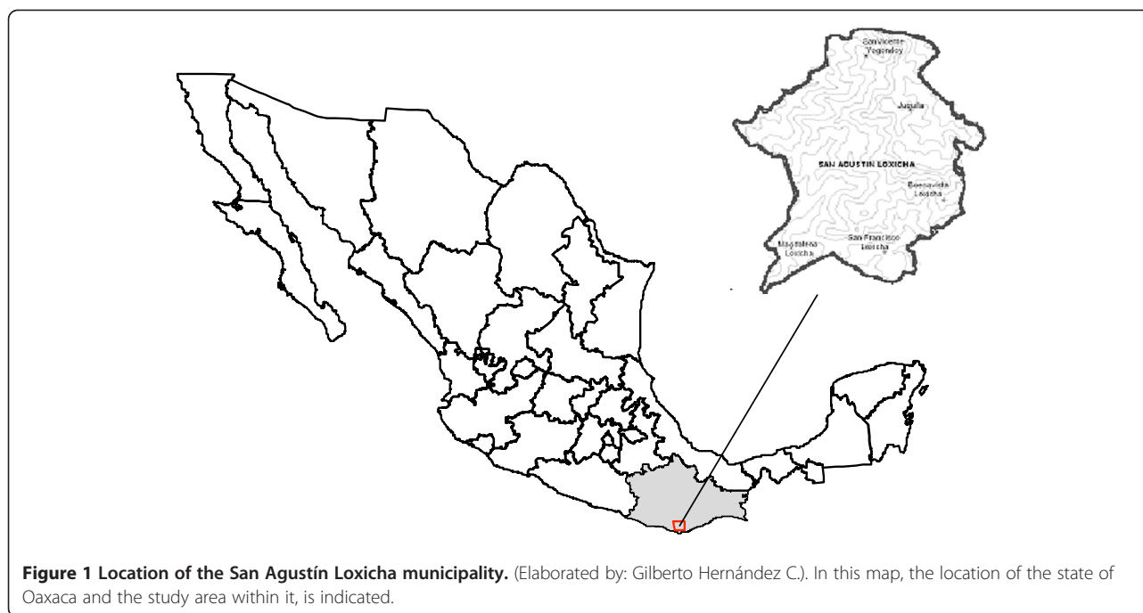
Figure 1 Location of the San Agustín Loxicha municipality. (Elaborated by: Gilberto Hernández C.). In this map, the location of the state of Oaxaca and the study area within it, is indicated.

ecological studies, until the last ten years, when few studies have been developed [29-36].